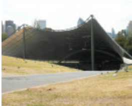
SIDNEY MYER MUSIC BOWL SOHE 2008