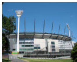
MELBOURNE CRICKET GROUND SOHE 2008