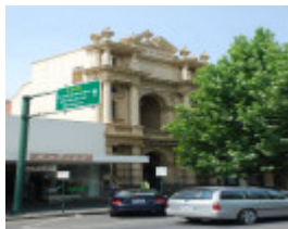
NATIONAL AUSTRALIA BANK SOHE 2008