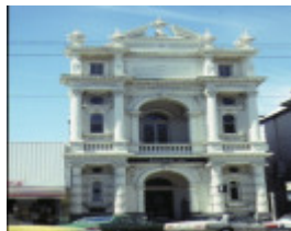
1 former colonial bank bendigo front view dec1993