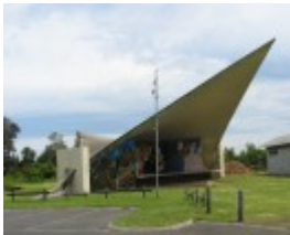
Rosebud sound shell KJ November 2011