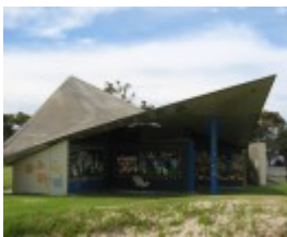
Rosebud sound shell KJ November 2011