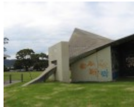
Rosebud sound shell KJ November 2011