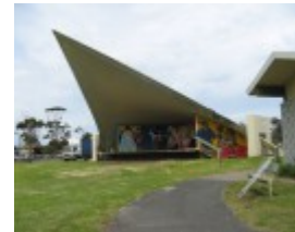
Rosebud sound shell KJ November 2011