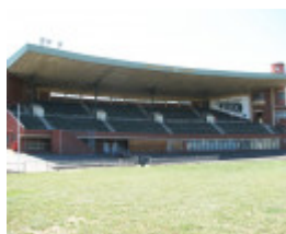
GLENFERRIE OVAL GRANDSTAND SOHE 2008