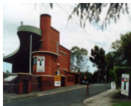
1 glenferrie oval grandstand linda crescent hawthorn side view