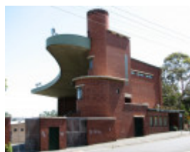
GLENFERRIE OVAL GRANDSTAND SOHE 2008