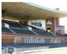
GLENFERRIE OVAL GRANDSTAND SOHE 2008