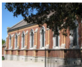
FORMER CONGREGATIONAL CHURCH SOHE 2008