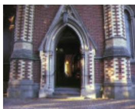
former congregational church brighton detail of front entrance