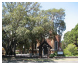
FORMER CONGREGATIONAL CHURCH SOHE 2008