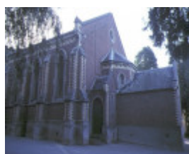
former congregational church brighton rear of church nov1984