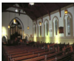
former congregational church brighton interior fron view