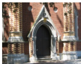
FORMER CONGREGATIONAL CHURCH SOHE 2008