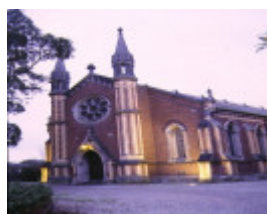
1 former congregational church brighton front view