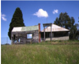
1 pontville yarra valley metropolitan park templestowe rear view nov1996