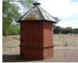
H2136 White Hills Cemetery 9 Feb 200 mz 022