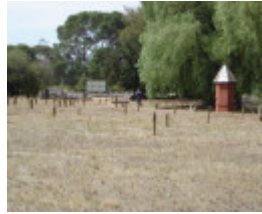
H2136 White Hills Cemetery 9 Feb 200 mz 025