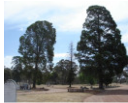
H2136 White Hills Cemetery 9 Feb 200 mz 041