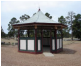
H2136 White Hills Cemetery 9 Feb 200 mz 048