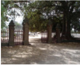
H2136 White Hills Cemetery 9 Feb 200 mz 001