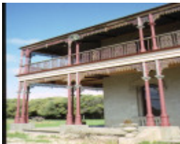
fairfield murray hwy browns plains verandah of homestead sep1990