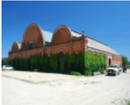
FAIRFIELD SOHE 2008