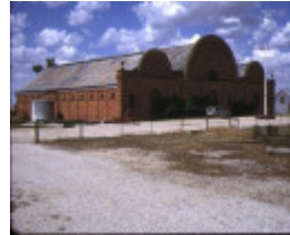
1 fairfield murray hwy browns plains wine cellars dec1987