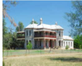
FAIRFIELD SOHE 2008