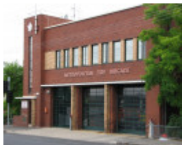
BRUNSWICK FIRE STATION AND FLATS SOHE 2008