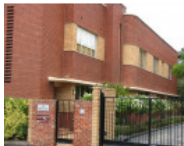
BRUNSWICK FIRE STATION AND FLATS SOHE 2008