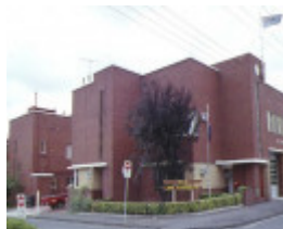
1 brunswick fire station & flats blyth street brunswick side elevation of firestation