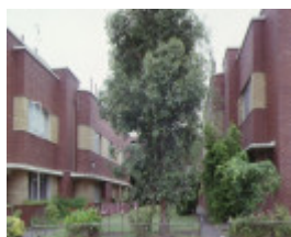
brunswick fire station & flats blyth street brunswick view of flats