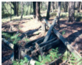
H02011 goodwood sawmill site