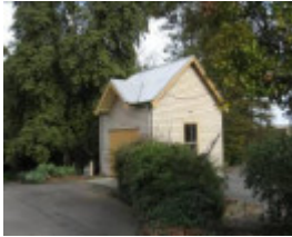
Coach housegarage (B5).jpg