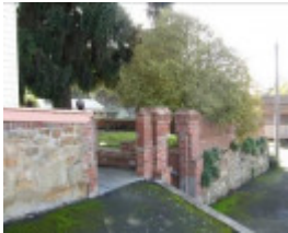
Garden wall (F3) south-east of house.jpg