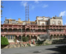
Eastern elevation of the house .jpg