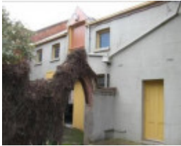
Stable & coach house (B2).jpg