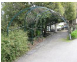
Fortuna_Bendigo_gardeb our_3 August 2009