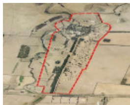
barunah plains air photo.JPG