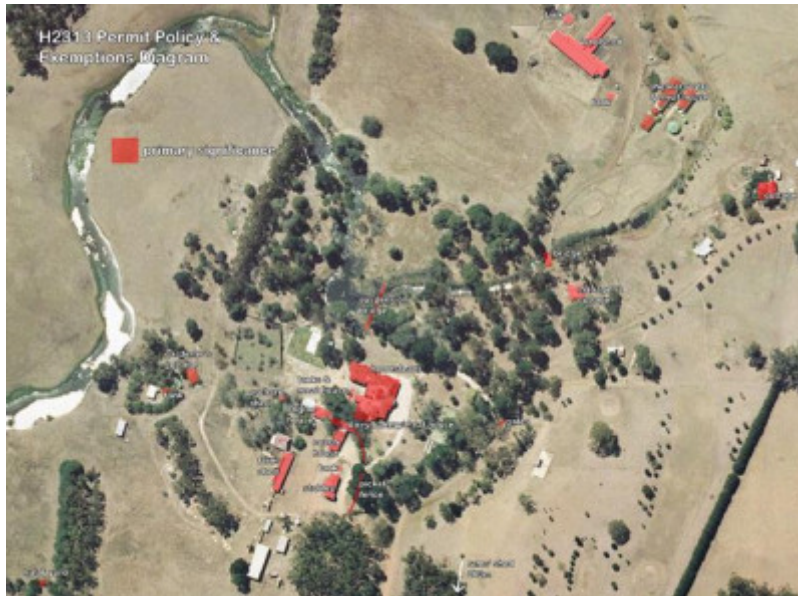
Permit Policy Diagram