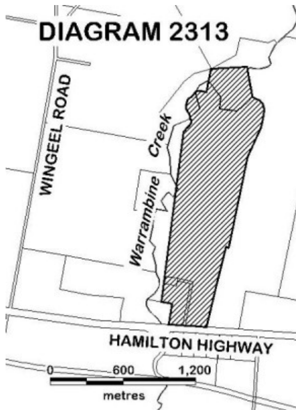
Extent Diagram for Barunah Plains in VHR