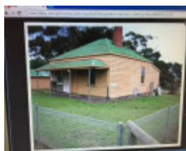
Cottage at Barunah Plains