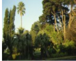
FOOTSCRAY PARK SOHE 2008 1 footscray park ballarat road footcra y palms