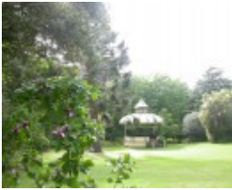
H2185 Hamilton B G bandstand