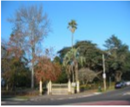
H2185 Hamilton B G Thompson St northern gates