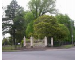
H2185 Hamilton B G Kennedy St western gates