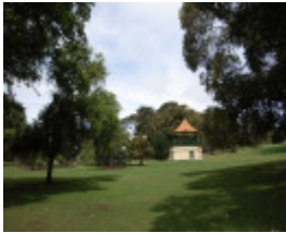
WARRNAMBOOL BOTANIC GARDENS SOHE 2008