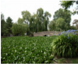
WARRNAMBOOL BOTANIC GARDENS SOHE 2008