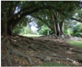
WARRNAMBOOL BOTANIC GARDENS SOHE 2008