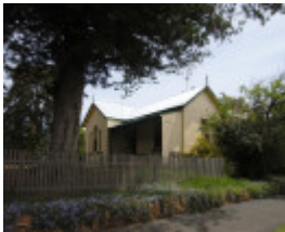
WARRNAMBOOL BOTANIC GARDENS SOHE 2008