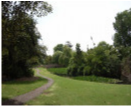
WARRNAMBOOL BOTANIC GARDENS SOHE 2008