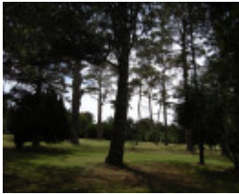
WARRNAMBOOL BOTANIC GARDENS SOHE 2008