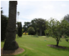
WARRNAMBOOL BOTANIC GARDENS SOHE 2008