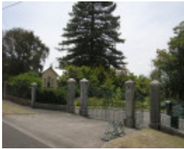
WARRNAMBOOL BOTANIC GARDENS SOHE 2008