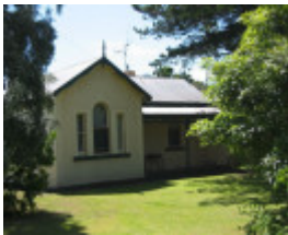
H2090 Warrnambool botanic gardens3 nov05