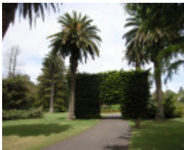
WARRNAMBOOL BOTANIC GARDENS SOHE 2008