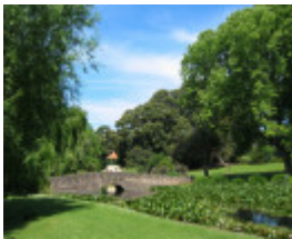
H2090 Warrnambool botanic gardens27 nov05