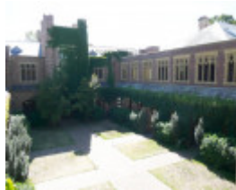
GEELONG COLLEGE SOHE 2008