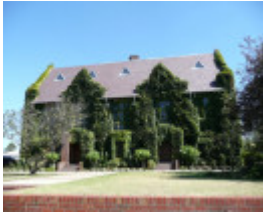
GEELONG COLLEGE SOHE 2008