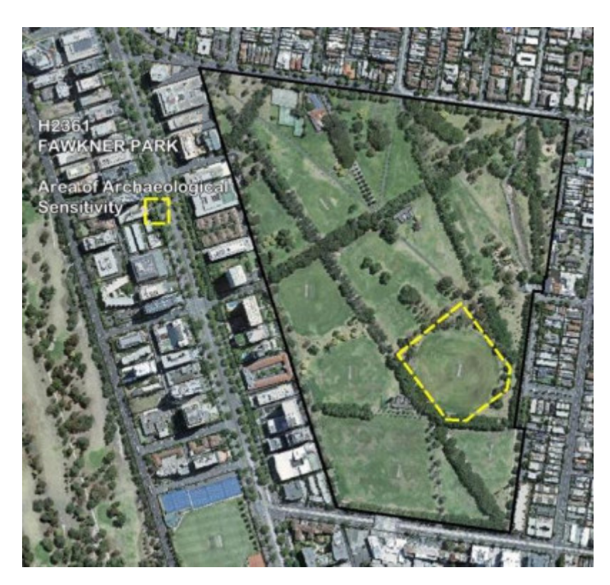
Diagram of Archaeological Sensitivity