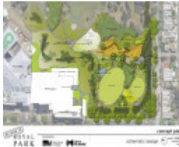
return to royal park concept plan.jpg