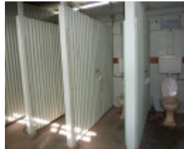
196487 f RAAF Base & Migrant Centre Benalla May 2015.JPG