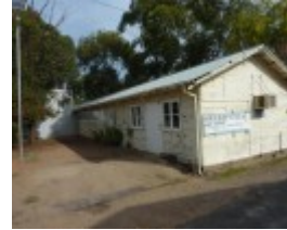
196487 f RAAF Base & Migrant Centre Benalla May 2015.JPG