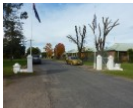
196487 f RAAF Base & Migrant Centre Benalla May 2015.JPG