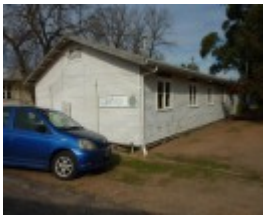
196487 f RAAF Base & Migrant Centre Benalla May 2015.JPG