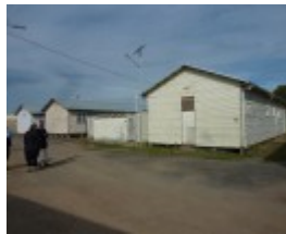
196487 f RAAF Base & Migrant Centre Benalla May 2015.JPG