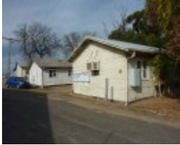
196487 f RAAF Base & Migrant Centre Benalla May 2015.JPG