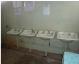
196487 f RAAF Base & Migrant Centre Benalla May 2015.JPG