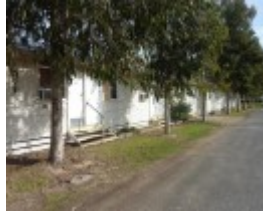
196487 f RAAF Base & Migrant Centre Benalla May 2015.JPG