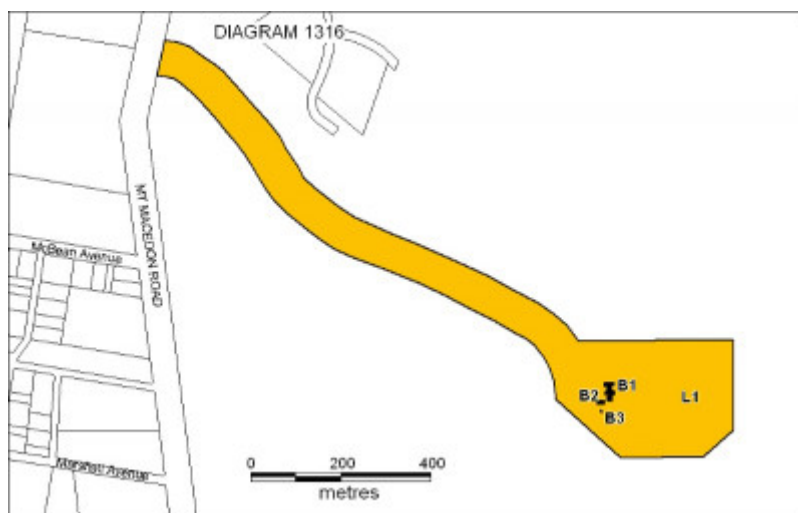
h01316 bolobek plan 1316