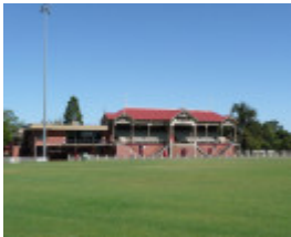
PRINCE'S PARK SOHE 2008