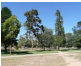
PRINCE'S PARK SOHE 2008