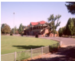
1 princes park park march2000 jh