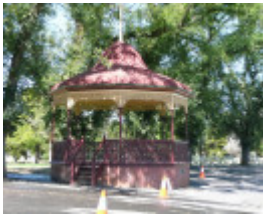
PRINCE'S PARK SOHE 2008