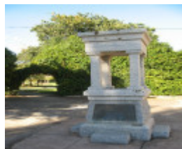
Central Park Stawell