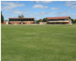
Central Park Stawell