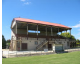
Central Park Stawell