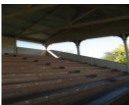
Central Park Stawell 28 Apr 2011_KJ (20).jpg