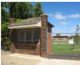
Central Park Stawell