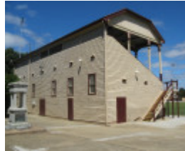
Central Park Stawell