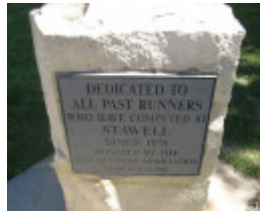
Central Park Stawell