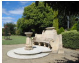
Central Park Stawell