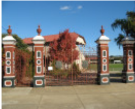
Central Park Stawell