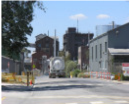
CSR COMPLEX SOHE 2008