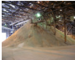
h01311 csr whitehall street yarraville interior bulk sugar store 12 04 mz