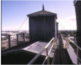
h01311 colonial sugar refinery whitehall street yarraville char tower