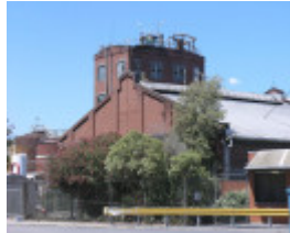
CSR COMPLEX SOHE 2008