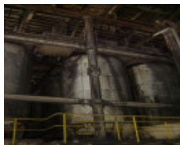
h01311 csr whitehall street yarraville interior south char end 02 12 04 mz