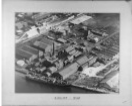
h01311 csr whitehall street yarraville august 1949