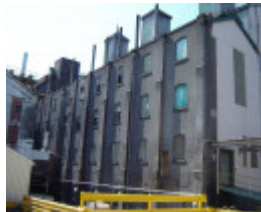
h01311 csr whitehall street yarraville north char ende 12 04 mz