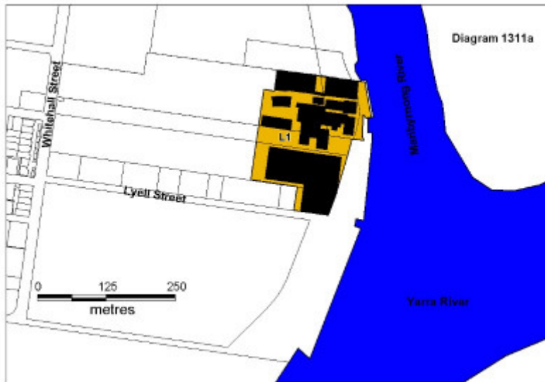
h01311 csr yarraville plan a mz april2005