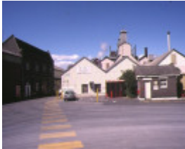
Colonial Sugar Refinery Whitehall Street Yarraville View from West