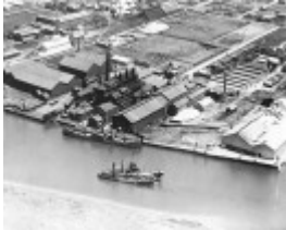
h01311 csr whitehall street yarraville december 1939