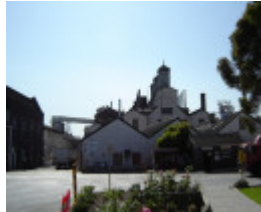
h01311 1 csr yarraville veiw from west 12 04 mz