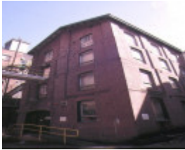
h01311 colonial sugar refinery whitehall street yarraville melting house