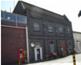
h01311 csr whitehall street yarraville bag store 12 04 mz