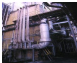
h01311 colonial sugar refinery whitehall street yarraville boiler house