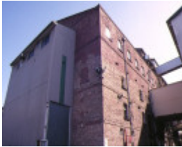
h01311 colonial sugar refinery whitehall street yarraville retail packing house