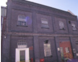
Colonial Sugar Refinery Whitehall Street Yarraville Store