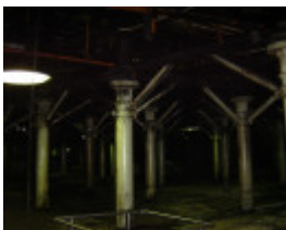
h01311 csr whitehall street yarraville interior south char end 01 12 04 mz