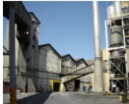
h01311 csr whitehall street yarraville bulk sugar store 12 04 mz