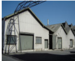
h01311 csr whitehall street yarraville engineers workshops 12 04 mz