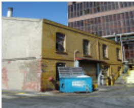
h01311 csr whitehall street yarraville golden syrup and treacle packing store 12 04 mz