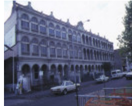
1 drummond terrace drummond street carlton front view of row may1985