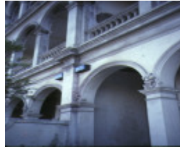
drummond terrace drummond street carlton detail of colonaded verandah may1990