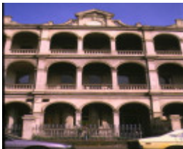
drummond terrace drummond street carlton front elevation sep1990