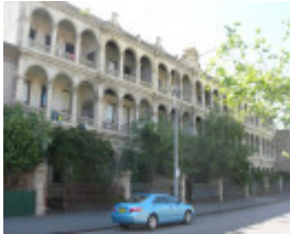
DRUMMOND TERRACE SOHE 2008