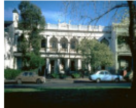
LOTHIAN BUILDINGS SOHE lothian buildings 2008