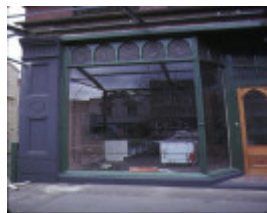
h00043 315 drummond street carlton exterior window