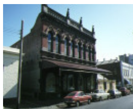
h00043 1 315 drummond street carlton exterior view