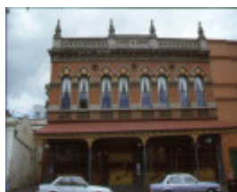
h00043 313 drummond street carlton exterior view