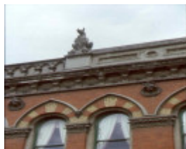
h00043 313 drummond street carlton exterior detail