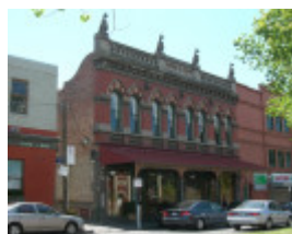
BUILDING SOHE 2008