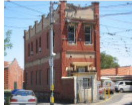
TRAM DEPOT SOHE 2008