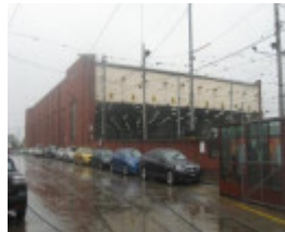
North car shed