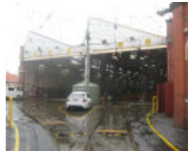
south car shed