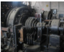
Substation - Rotary converters