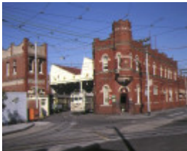
1 tram depot coldblo road malvern tram entrance