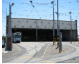
TRAM DEPOT SOHE 2008