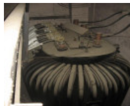
Substation - transformers