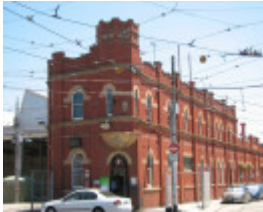
TRAM DEPOT SOHE 2008