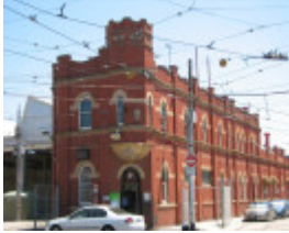
TRAM DEPOT SOHE 2008