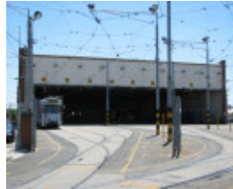
TRAM DEPOT SOHE 2008