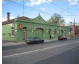
Northcote Tramways Building Thornbury Oct 2007 mz High Street Elevation