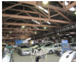
Northcote Tramways Building Thornbury May 2009 mz Engine House Interior 01