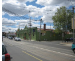
Northcote Tramways Building Thornbury Oct 2007 mz High Street & Martin Street Elevations