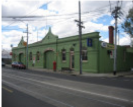
Northcote Tramways Building Thornbury Oct 2007 mz Front Elevation 01