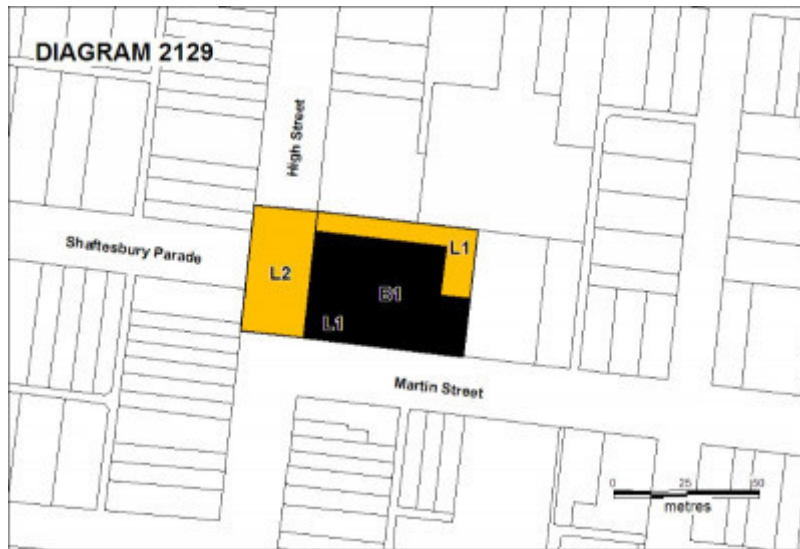
Northcote Cable Tram Building Plan June 2009