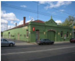
Northcote Tramways Building Thornbury Oct 2007 mz Front 7 North Elevations