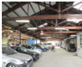
Northcote Tramways Building Thornbury May 2009 mz Car Shed Interior