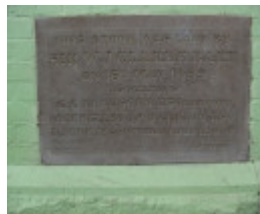
Northcote Tramways Building Thornbury May 2009 mz Foundation Stone