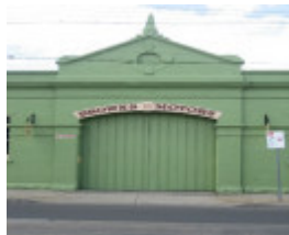
Northcote Tramways Building Thornbury Oct 2007 mz Car Shed Entry