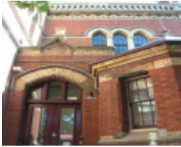
FORMER PRIMARY SCHOOL NO. 2365 SOHE 2008