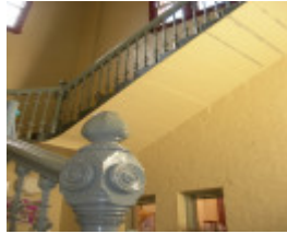
FORMER PRIMARY SCHOOL NO. 2365 SOHE 2008