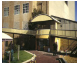
former primary school number 2365 queensberry street carlton new development