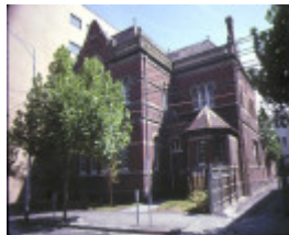
former primary school number 2365 queensberry street carlton front corner view feb1985