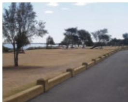
Esplanade Foreshore Heritage Precinct, Hobsons Bay Heritage Study 2006