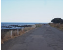
Point Gellibrand Heritage Precinct WILLIAMSTOWN, Hobsons Bay Heritage Study 2006