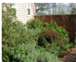
Manningham Heritage Garden & Significant Tree Study 2006