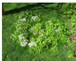
Manningham Heritage Garden & Significant Tree Study 2006