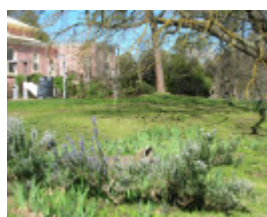
Manningham Heritage Garden & Significant Tree Study 2006