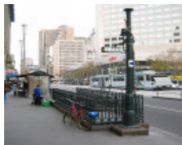
23086 Underground women's toilet Elizabeth St GPO 08 06 06 mz 023