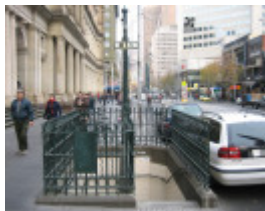
Underground men's toilet Elizabeth St GPO 08 06 06 mz 036