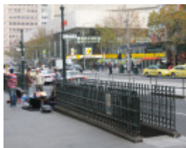
Underground women's toilet Elizabeth St GPO 08 06 06 mz 025