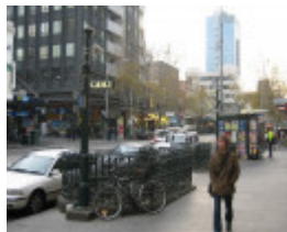
Underground men's toilet Elizabeth St GPO 08 06 06 mz 026