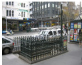
Underground men's toilet Elizabeth St GPO 08 06 06 mz 028