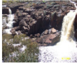
23207 Nigretta Falls 0190