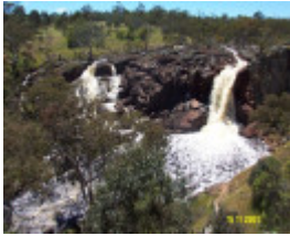
23207 Nigretta Falls 0188