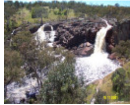
23207 Nigretta Falls 0189