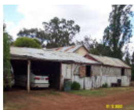
23222 Yat Nat Homestead Balmoral stables 2190