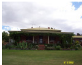
23222 Yat Nat Homestead Balmoral facade 2186