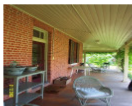
23222 Yat Nat Homestead Balmoral verandah 2183