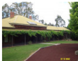
23222 Yat Nat Homestead Balmoral rear 2192