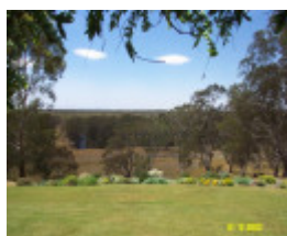
23222 Yat Nat Homestead Balmoral view 2181