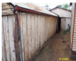
23222 Yat Nat Homestead Balmoral stables 2189