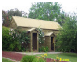
23222 Yat Nat Homestead Balmoral service wing 2191