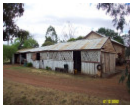
23222 Yat Nat Homestead Balmoral stables 2187