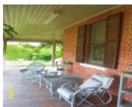
23222 Yat Nat Homestead Balmoral verandah 2182