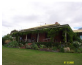
23222 Yat Nat Homestead Balmoral facade 2185