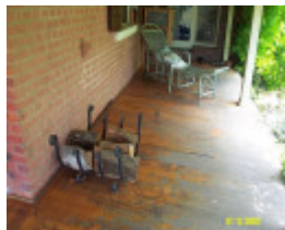
23222 Yat Nat Homestead Balmoral cellar door 2184