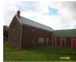
23435 Skene Homestead Strathkellar stables 1573