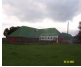
23435 Skene Homestead Strathkellar woolshed 1629