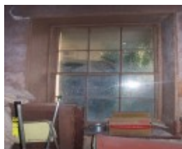
23435 Skene Homestead Strathkellar 1858 cellar 1594