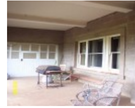
23435 Skene Homestead Strathkellar 1858 verandah 1558