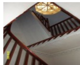
23435 Skene Homestead Strathkellar 1858 staircase 1605