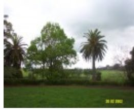
23435 Skene Homestead Strathkellar garden 1564