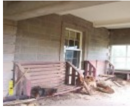
23435 Skene Homestead Strathkellar 1858 verandah 1557