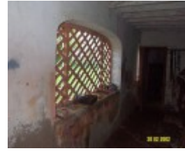
23435 Skene Homestead Strathkellar stables 1626