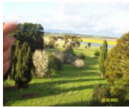
23435 Skene Homestead Strathkellar outlook 1611