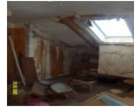
23435 Skene Homestead Strathkellar 1858 attic 1608