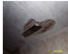
23435 Skene Homestead Strathkellar 1858 cellar 1595