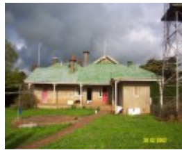
23435 Skene Homestead Strathkellar 1923 rear 1579