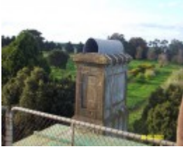
23435 Skene Homestead Strathkellar 1858 chimney 1612