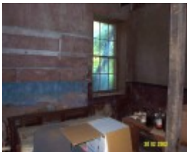
23435 Skene Homestead Strathkellar 1858 cellar 1593