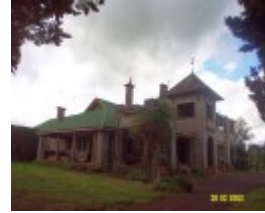
23435 Skene Homestead Strathkellar 1923 facade 1568