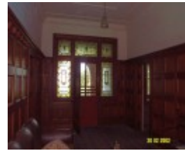
23435 Skene Homestead Strathkellar 1923 hall 1616