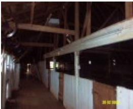
23435 Skene Homestead Strathkellar woolshed 1633