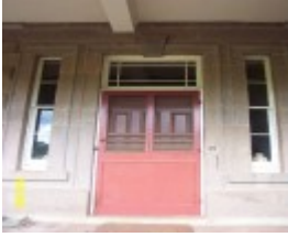
23435 Skene Homestead Strathkellar 1858 front door 1556