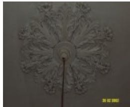
23435 Skene Homestead Strathkellar 1858 hall ceiling 1585