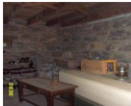
23435 Skene Homestead Strathkellar 1858 cellar 1599