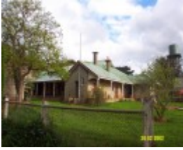
23435 Skene Homestead Strathkellar utility shed 1574