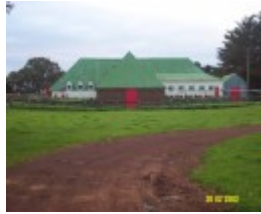
23435 Skene Homestead Strathkellar woolshed 1642