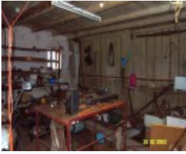
23435 Skene Homestead Strathkellar stables 1624