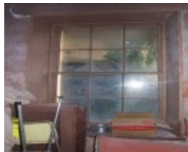
23435 Skene Homestead Strathkellar 1858 cellar 1594