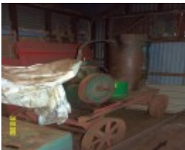
23435 Skene Homestead Strathkellar woolshed engine 1639