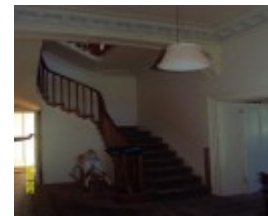
23435 Skene Homestead Strathkellar 1858 hall 1584