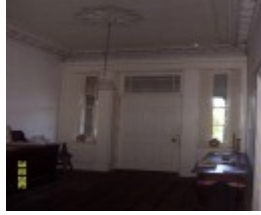
23435 Skene Homestead Strathkellar 1858 front door 1582