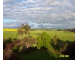
23435 Skene Homestead Strathkellar outlook 1609