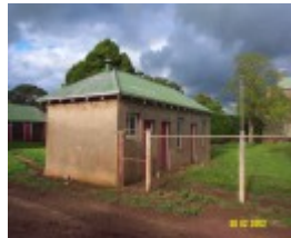
23435 Skene Homestead Strathkellar generator shed