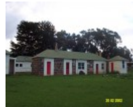
23435 Skene Homestead Strathkellar mens quarters 1627