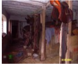
23435 Skene Homestead Strathkellar stables 1625