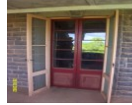
23435 Skene Homestead Strathkellar 1858 french doors 1603