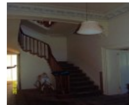
23435 Skene Homestead Strathkellar 1858 hall 1584