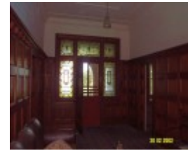
23435 Skene Homestead Strathkellar 1923 hall 1616