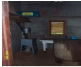
23435 Skene Homestead Strathkellar 1923 meathouse 1619