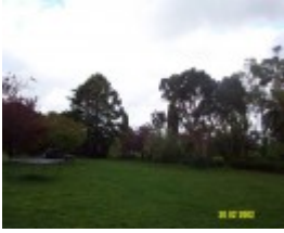
23435 Skene Homestead Strathkellar garden 1563