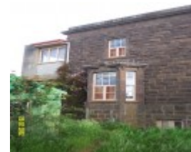
23435 Skene Homestead Strathkellar 1858 side elevation 1571