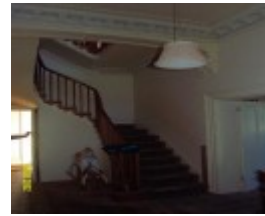
23435 Skene Homestead Strathkellar 1858 hall 1584