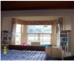
23435 Skene Homestead Strathkellar 1858 bay window 1586