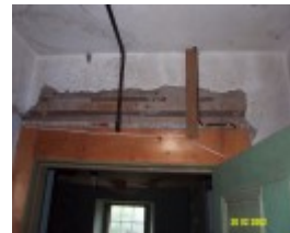
23435 Skene Homestead Strathkellar 1858 cellar 1601