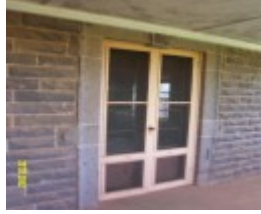
23435 Skene Homestead Strathkellar 1858 french doors 1602