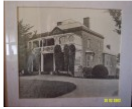
23435 Skene Homestead Strathkellar c1890 1581