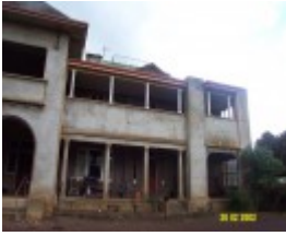
23435 Skene Homestead Strathkellar 1923 verandah 1559