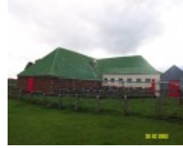
23435 Skene Homestead Strathkellar woolshed 1630