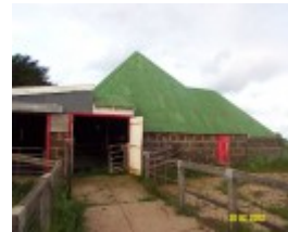
23435 Skene Homestead Strathkellar woolshed 1637