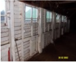
23435 Skene Homestead Strathkellar woolshed 1640