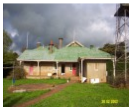
23435 Skene Homestead Strathkellar 1923 rear 1579