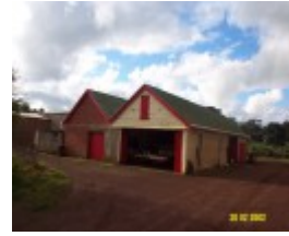
23435 Skene Homestead Strathkellar garages