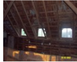
23435 Skene Homestead Strathkellar woolshed dormers 1636