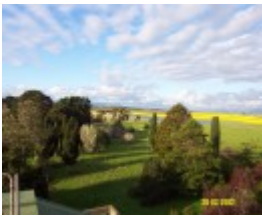
23435 Skene Homestead Strathkellar outlook 1610