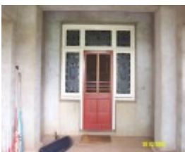
23435 Skene Homestead Strathkellar 1923 front door 1567