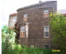
23435 Skene Homestead Strathkellar 1858 side elevation 1570