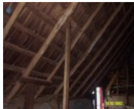
23435 Skene Homestead Strathkellar woolshed poles shingles 1635