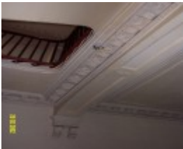
23435 Skene Homestead Strathkellar 1858 hall ceiling 1583