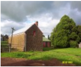
23435 Skene Homestead Strathkellar generator shed 1575