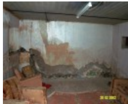
23435 Skene Homestead Strathkellar 1858 cellar 1589