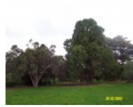
23435 Skene Homestead Strathkellar garden 1565