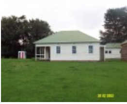
23435 Skene Homestead Strathkellar mens quarters 1628