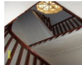
23435 Skene Homestead Strathkellar 1858 staircase 1605