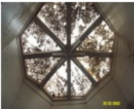
23435 Skene Homestead Strathkellar 1858 skylight 1613