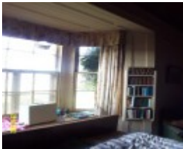
23435 Skene Homestead Strathkellar 1858 bay window 1588