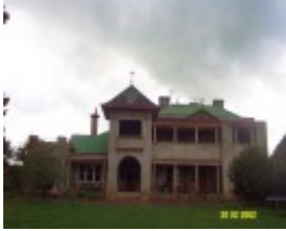
23435 Skene Homestead Strathkellar 1923 facade 1562