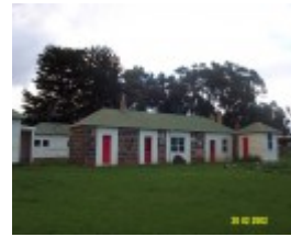
23435 Skene Homestead Strathkellar mens quarters 1627