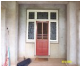
23435 Skene Homestead Strathkellar 1923 front door 1567