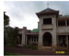
23435 Skene Homestead Strathkellar 1923 tower 1560