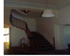
23435 Skene Homestead Strathkellar 1858 hall 1584