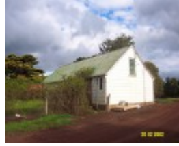
23435 Skene Homestead Strathkellar outbuilding 1578