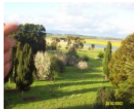
23435 Skene Homestead Strathkellar outlook 1611