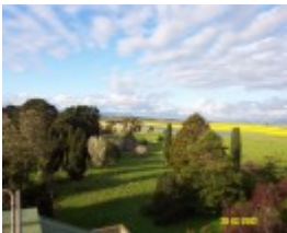
23435 Skene Homestead Strathkellar outlook 1610