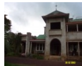
23435 Skene Homestead Strathkellar 1923 tower 1560