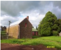
23435 Skene Homestead Strathkellar generator shed 1575