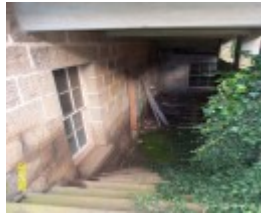
23435 Skene Homestead Strathkellar 1853 rear 1580