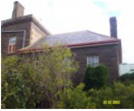
23435 Skene Homestead Strathkellar 1880s billiard room 1572