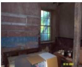
23435 Skene Homestead Strathkellar 1858 cellar 1593