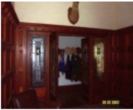
23435 Skene Homestead Strathkellar 1923 hall 1617