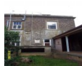
23435 Skene Homestead Strathkellar 1858 rear 1623