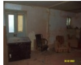
23435 Skene Homestead Strathkellar 1858 cellar 1590