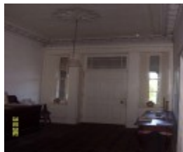
23435 Skene Homestead Strathkellar 1858 front door 1582