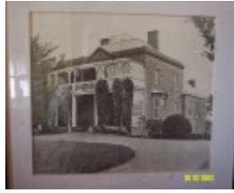
23435 Skene Homestead Strathkellar c1890 1581