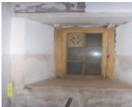
23435 Skene Homestead Strathkellar 1858 cellar 1598