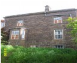
23435 Skene Homestead Strathkellar 1858 side elevation 1569