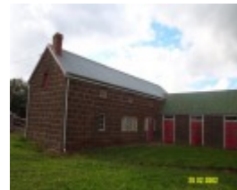
23435 Skene Homestead Strathkellar stables 1573