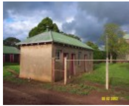
23435 Skene Homestead Strathkellar generator shed