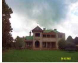
23435 Skene Homestead Strathkellar 1923 facade 1561