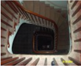
23435 Skene Homestead Strathkellar 1858 staircase 1615