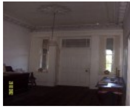
23435 Skene Homestead Strathkellar 1858 front door 1582