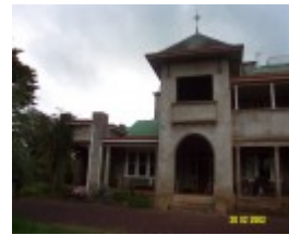
23435 Skene Homestead Strathkellar 1923 tower 1560