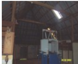
23435 Skene Homestead Strathkellar woolshed 1634