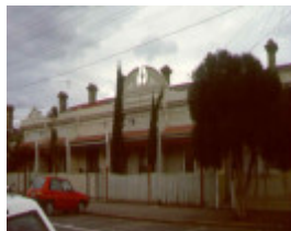
1 jubilee terrace nott st port melbourne