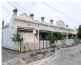
JUBILEE TERRACE SOHE 2008