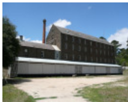
ANDERSONS MILL COMPLEX SOHE 2008