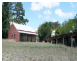
ANDERSONS MILL COMPLEX SOHE 2008