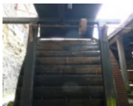
ANDERSONS MILL COMPLEX SOHE 2008