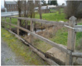
bridge close up.jpg