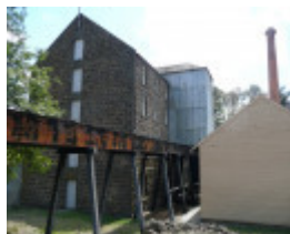
ANDERSONS MILL COMPLEX SOHE 2008