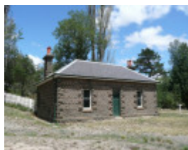
ANDERSONS MILL COMPLEX SOHE 2008