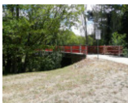
ANDERSONS MILL COMPLEX SOHE 2008