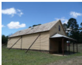
ANDERSONS MILL COMPLEX SOHE 2008