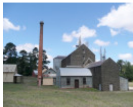
ANDERSONS MILL COMPLEX SOHE 2008