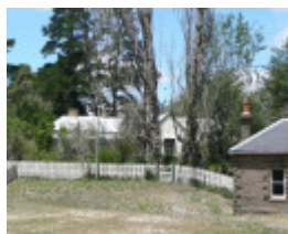
ANDERSONS MILL COMPLEX SOHE 2008