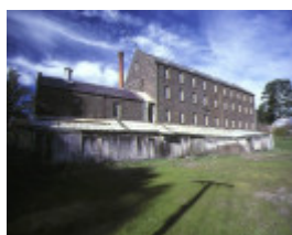
1 andersons mill complex off alice street smeaton front view jul1987