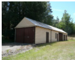
ANDERSONS MILL COMPLEX SOHE 2008