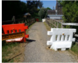
bridge with barriers.jpg