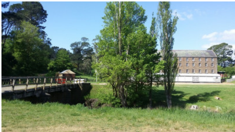
Whole site 2015.jpg