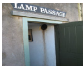
Portland Battery_28 Apr 2011_KJ (47).jpg