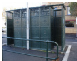
Urinal Nth Melbourne exterior 21 07 2007