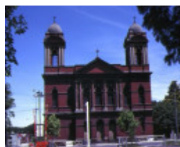
1 sacred heart church front view