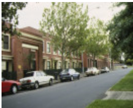
former cable tram engine house rathdowne street carlton north front converted into apartments