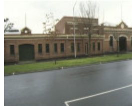
1 former cable tram engine house rathdowne street carlton north street view sep1993