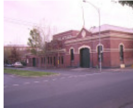
former cable tram engine house rathdowne street carlton north exterior of car shed corner view jun1995