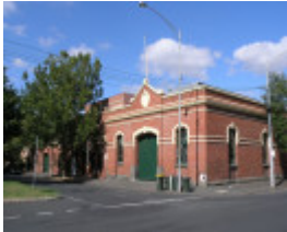
FORMER CABLE TRAM ENGINE HOUSE SOHE 2008