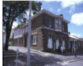
1 ararat post office front view nov1985