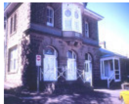
h00618 former ararat post office barkly street ararat front she project 2004