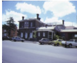
ararat post office street view nov1985