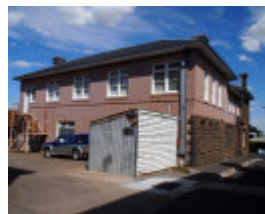
H0618 FORMER ARARAT SUB-TREASURY AND POST OFFICE LHA 2015 3.JPG