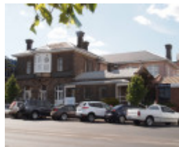
H0618 FORMER ARARAT SUB-TREASURY AND POST OFFICE LHA 2015 1.JPG