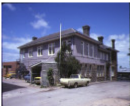
ararat post office street view3 nov1985