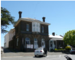
FORMER ARARAT SUB-TREASURY AND POST OFFICE SOHE 2008