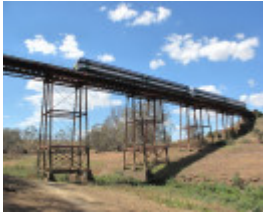
2504_Melton Railway Viaduct_7 November 2009_HV_041_lo res.jpg