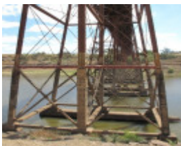
2504_Melton Railway Viaduct_7 November 2009_HV_019_lo res.jpg