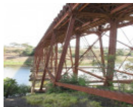
2504_Melton Railway Viaduct_7 November 2009_HV_026_lo res.jpg