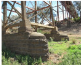
2504_Melton Railway Viaduct_7 November 2009_HV_055_lo res.jpg