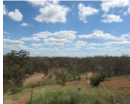
2504_Melton Railway Viaduct_7 November 2009_HV_001_lo res.jpg