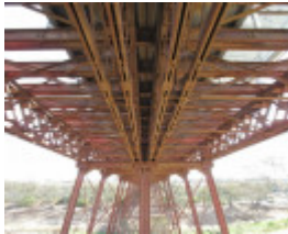
2504_Melton Railway Viaduct_7 November 2009_HV_068_lo res.jpg