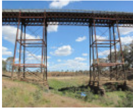
2504_Melton Railway Viaduct_7 November 2009_HV_056_lo res.jpg