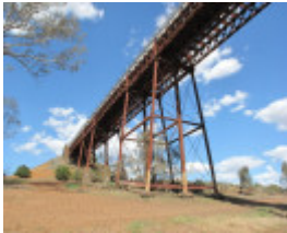
2504_Melton Railway Viaduct_7 November 2009_HV_058_lo res.jpg