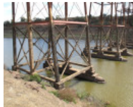
2504_Melton Railway Viaduct_7 November 2009_HV_012_lo res.jpg