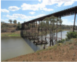
2504_Melton Railway Viaduct_7 November 2009_HV_032_lo res.jpg