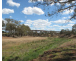
2504_Melton Railway Viaduct_7 November 2009_HV_005_lo res.jpg