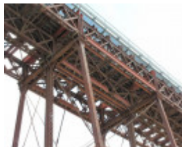
2504_Melton Railway Viaduct_7 November 2009_HV_016_lo res.jpg