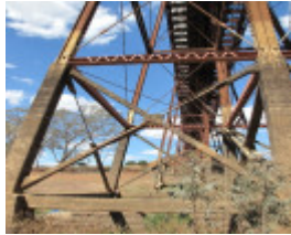
2504_Melton Railway Viaduct_7 November 2009_HV_048_lo res.jpg