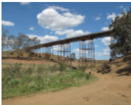
2504_Melton Railway Viaduct_7 November 2009_HV_007_lo res.jpg