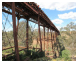
2504_Melton Railway Viaduct_7 November 2009_HV_030_lo res.jpg