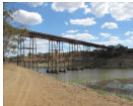
2504_Melton Railway Viaduct_7 November 2009_HV_009_lo res.jpg