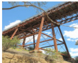
2504_Melton Railway Viaduct_7 November 2009_HV_017_lo res.jpg