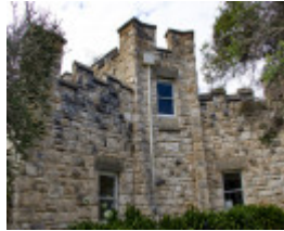
Delgany Garage image 1