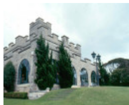
Delgany Portsea 1925 House September 2003