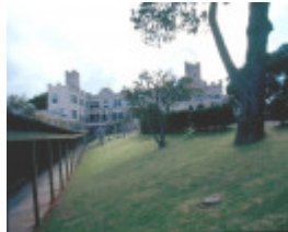
h02058 delgany portsea 1925 1953 1968 wings sept03 mz