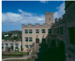
Delgany Portsea 1953 Wing September 2003