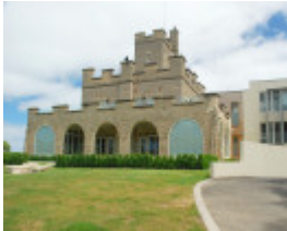
DELGANY SOHE 2008