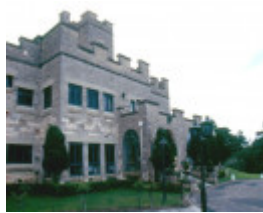
Delgany Portsea 1925 House September 2003