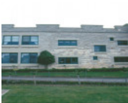
Delgany Portsea Join of 1953 and 1925 House September 2003