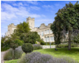
Delgany Castle with formal gardens