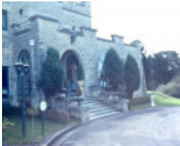
Delgany Portsea 1925 House September 2003