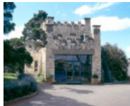
h02058 delgany portsea garage sept03 mz