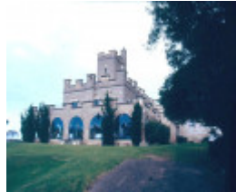
h02058 1 delgany portsea 1925 house sept03 mz