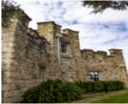
Delgany Garage image 3