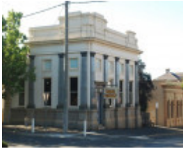
FORMER STATE SAVINGS BANK SOHE 2008