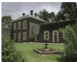
1 mental hospital ararat courtyard view