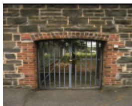
mental hospital ararat gate 1994