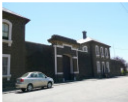
J WARD (ARARAT ASYLUM) SOHE 2008