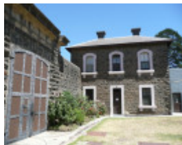
J WARD (ARARAT ASYLUM) SOHE 2008