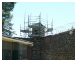
J WARD (ARARAT ASYLUM) SOHE 2008