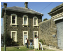
mental hospital ararat front gate & gatehouse