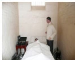
J WARD (ARARAT ASYLUM) SOHE 2008