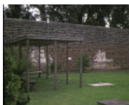
mental hospital ararat wall paintings