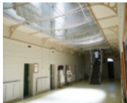
J WARD (ARARAT ASYLUM) SOHE 2008