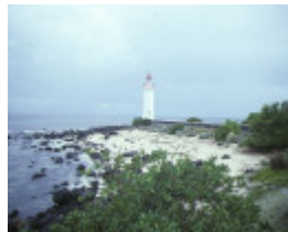
griffith island lighthouse griffith island port fairy landscape