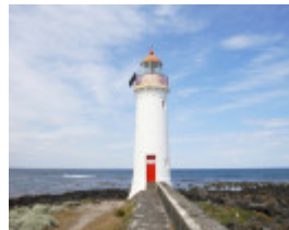
GRIFFITHS ISLAND SOHE 2008