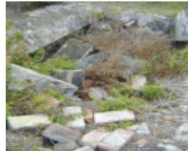
H1659 griffith island port fairy keepers quarters remains