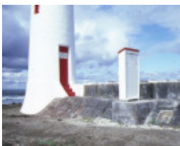
griffith island lighthouse griffith island port fairy entrance