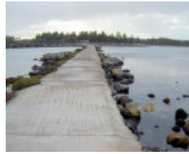
H1659 griffith island port fairy causeway