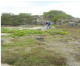
H1659 griffith island port fairy quarry2