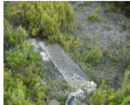
H1659 griffith island port fairy keepers quarters remains2