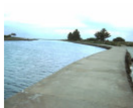
H1659 griffith island port fairy training wall