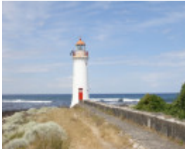
GRIFFITHS ISLAND SOHE 2008