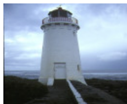
griffith island lighthouse griffith island port fairy rear view