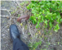
H1659 griffith island port fairy lighthouse mast footings