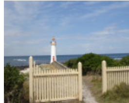
GRIFFITHS ISLAND SOHE 2008