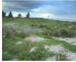
H1659 griffith island port fairy landscape3