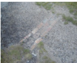
H1659 griffith island port fairy keepers quarters garden remains