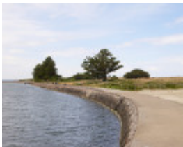
GRIFFITHS ISLAND SOHE 2008