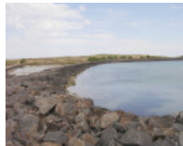
GRIFFITHS ISLAND SOHE 2008