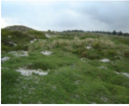
H1659 griffith island port fairy landscape