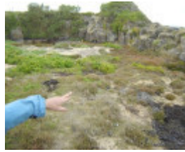
H1659 griffith island port fairy quarry1