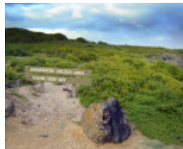
H1659 griffith island port fairy shearwater colony