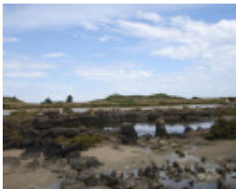
GRIFFITHS ISLAND SOHE 2008