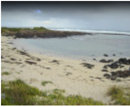
H1659 griffith island port fairy beach1