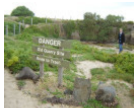
H1659 griffith island port fairy quarry3