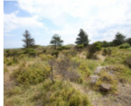
GRIFFITHS ISLAND SOHE 2008