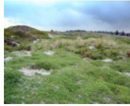
H1659 griffith island port fairy landscape2