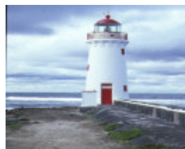
1 griffith island lighthouse griffith island port fairy front view