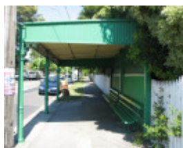
TRAM VERANDAH SHELTER SOHE 2008