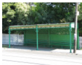
TRAM VERANDAH SHELTER SOHE 2008