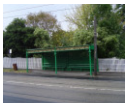
H0174 Tram shelter Balaclava Rd Front view Apr 2006